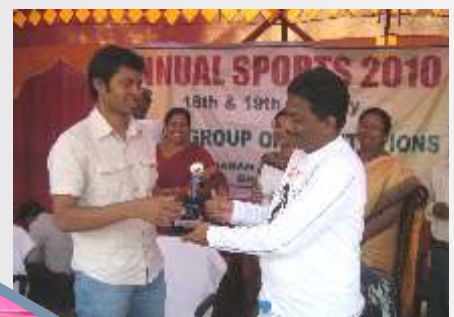
Padmashree Dillip Tirkey, International Hockey star