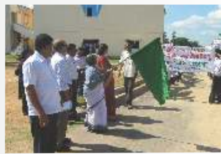
Flagged off by Padmashree Tulasi Munda (Drive against child labour)