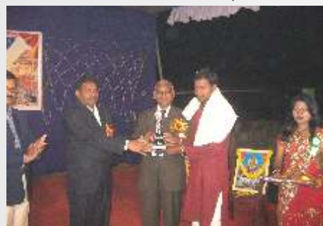
Felicitation to Shree Sudarsan Pattnaik, Famous Sand Artiste