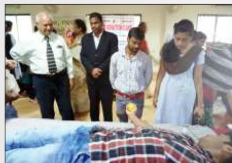
Blood donation camp

The college represents a blend between quality education for its students and their social commitments. In discharging their true responsibilities for the people, the students have actively participated in many social events. To name a few: